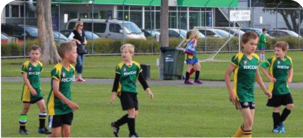
A junior team plays in a primary school six-a-side football tournament

Ricoh has long recognised that it is in a position to help the communities in which it operates and has chosen to take both a national and regional approach to how it engages with different groups. Ricoh is a part of the community and our community is our framework, so we see it as a basic responsibility to give back and stay in touch. Ricoh New Zealand supports a number of schools, organisations and individuals with a sport, activity or environmental focus. Here is a small selection of the schools and groups we support: