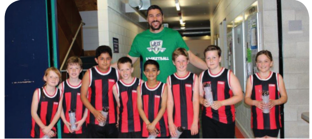
College Street Normal School Basketball team Their performance helped the school win the Ricoh Cup