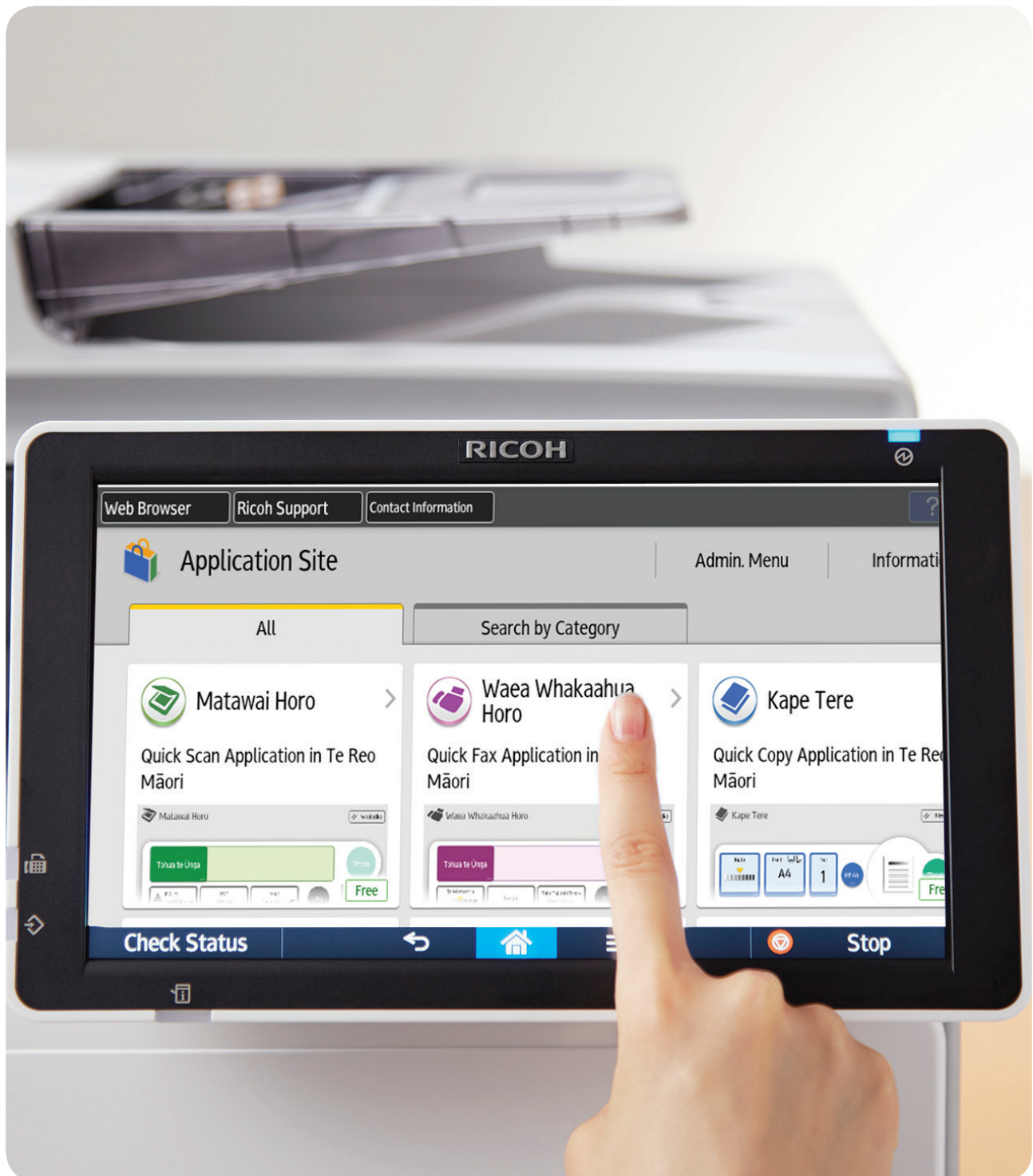
The Ricoh-developed te Reo Māori app available on our MFD Smart Operation Panels.

Our involvement stretches beyond just the provision of technology to meet the business needs of our schools. We are proactively seeking out opportunities to make a real difference to schools and their communities by offering additional assistance in sport and cultural sponsorship, technology initiatives, scholarships and community-driven activities.