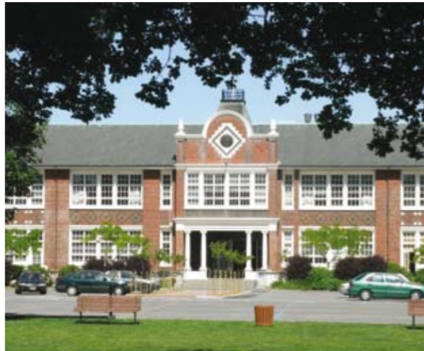
Hagley College's impressive main building.

Using technology to empower individuals to make environmentally and economically sensible printing decisions sounds like a dream, but that's exactly what a distinctive New Zealand secondary school has achieved with a little bit of help from Ricoh.