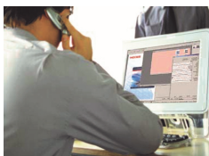
The user sends their job to print as normal.