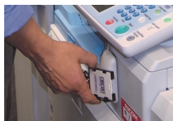
At the MFD of their choice, the user swipes their building access card.