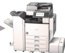
The print job(s) are outputted.